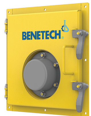
Doors with Plug Chute Sensors